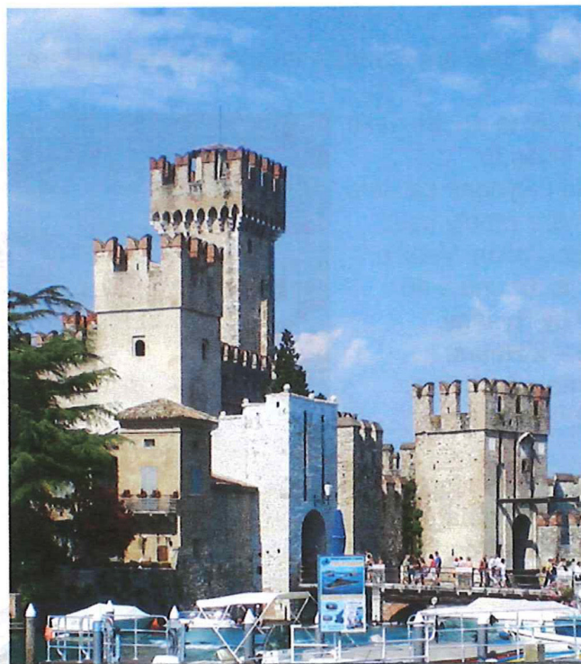
Pictured above: Sirmione

If you have a gun and wish to shoot then there are a number of shooting grounds in the area, Lonato near Desenzano is the most famous.