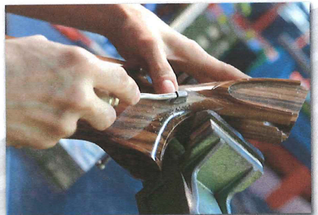
Above: Chequering is all done by hand.

If you wish to you can come back and check the finished stock on the pattern plate again to ensure the fit and feel is to your satisfaction.