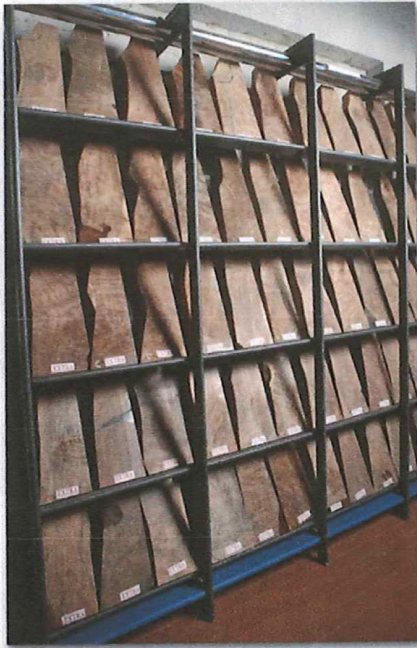
Above: Wood Blanks

Customers from all over the world visit to have guns serviced, have new stocks made or be measured for a new gun. Others just visit to enjoy a unique experience.